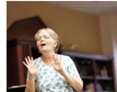
Younger onset Alzheimer's patients stay active