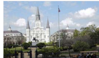
Propose on a carriage ride through the Garden District or in the French Quarter... (Katherine Rodeghier, Chicago Tribune)

Sure, you can pose the question over an intimate dinner at a local restaurant or just during a snuggle on the couch, but why not make a marriage proposal part of a romantic vacation? You'll be creating pages in a new book of memories, adding chapters later for the wedding, honeymoon , maybe a family.