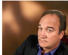
Jim Belushi champions gout treatment