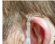
Now hear this