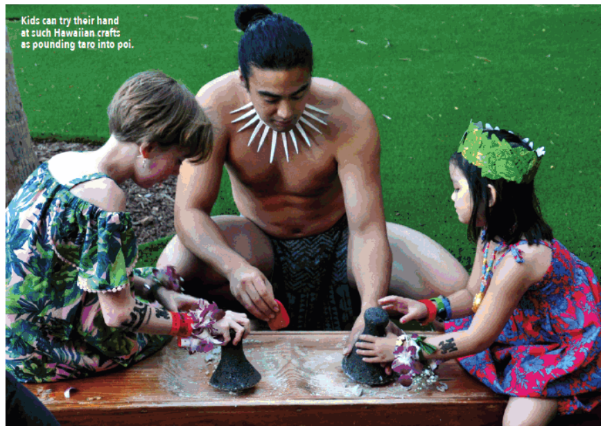
Kids can try their hand at such Hawaiian crafts as pounding taro into poi.

Agent Assistance: College of Disney Knowledge training courses, print collateral, site visit opportunities, educational programs and social media resources via the Disney Travel Professionals Facebook page.