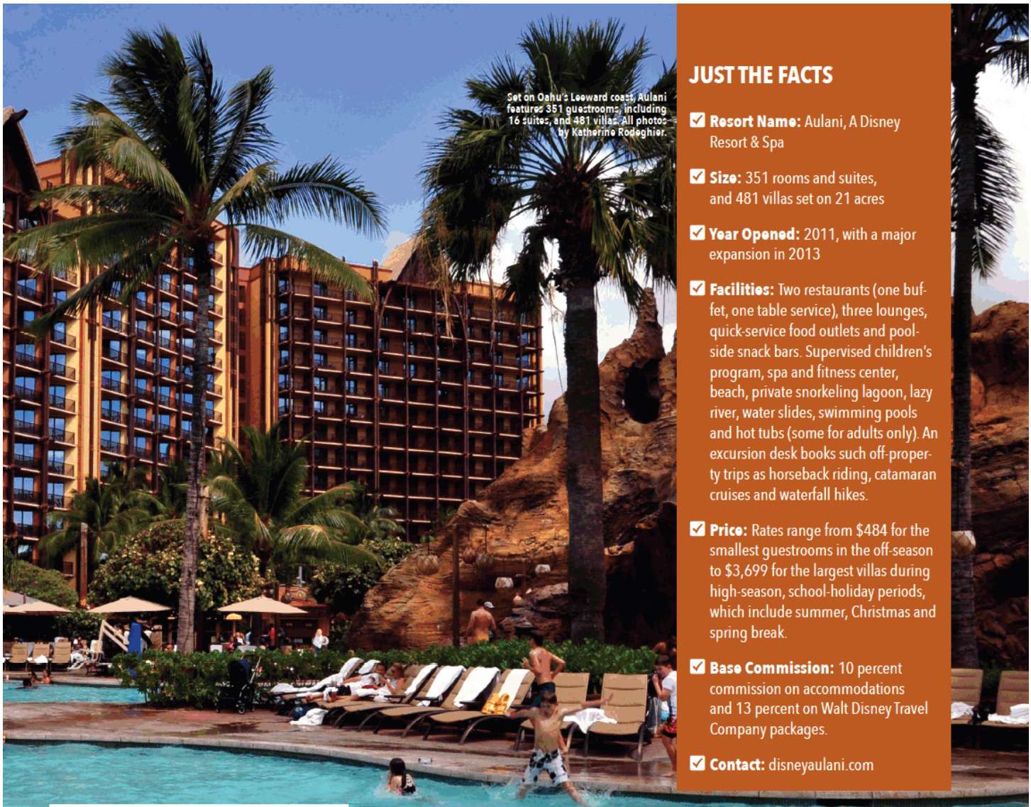
Set on Oahu's leeward coast, Aulani features 351 guestrooms, including 16 suites, and 481 villas.