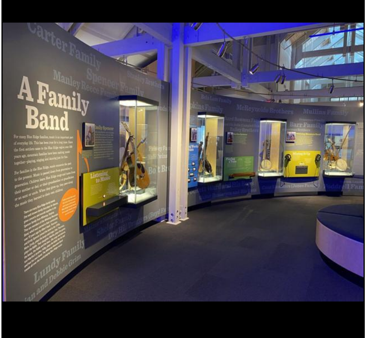
The Roots of American Music exhibit at the Blue Ridge Music Center, Milepost 213 on the Blue Ridge Parkway, details the evolution of traditional songs and musical instruments of the region.