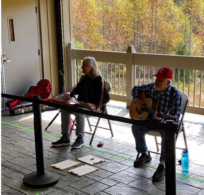
From May to October, musicians give casual weekday performances on the breezeway of the Blue Ridge Music Center, a stop on the Blue Ridge Parkway.