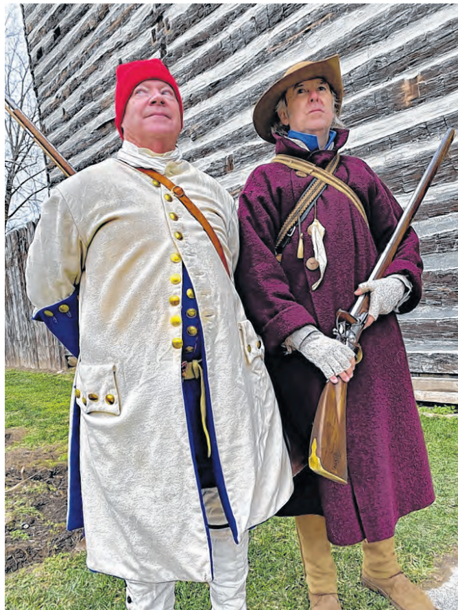
Re-enactors take visitors back to the 19th century at The Old Fort.