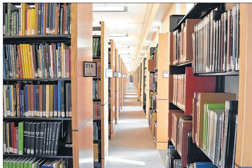
The Genealogy Center at the Allen County Public Library has more than a million physical items covering the size of a football field.