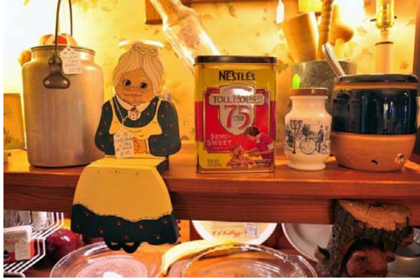
Antiques and collectibles shoppers browse through the merchandise displayed at Antiques Etcetera in a farmhouse near Stockton, Ill.

If your idea of vintage goods leans more to something you can sip, know that the Upper Mississippi Valley wine region encompasses Jo Daviess County. Family-run vineyards dot the hills and four wineries invite visitors for tastings of their vintages. Stop by Rocky Waters Vineyard/Winery and Fergedaboutit Vineyard and Winery near Hanover and Massbach Ridge Winery outside Elizabeth. Galena Cellars Vineyard and Winery in Galena has been going strong since the 1970s. Both Massbach Ridge and Galena Cellars also operate tasting rooms right on Galena's Main Street, convenient if you want to mix a little sipping with your shopping.