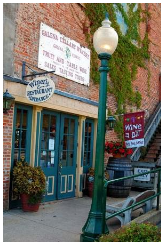
Galena Cellars has a shop and tasting room on Main Street in Galena, Ill., as well as a winery open for tours in the countryside.

You'll find fine dining a short drive into the country at the Goldmoor Inn where beef Wellington ranks as a favorite. You can overnight here, too, in one of 18 luxury guest suites, including two log cabins and three cottages.