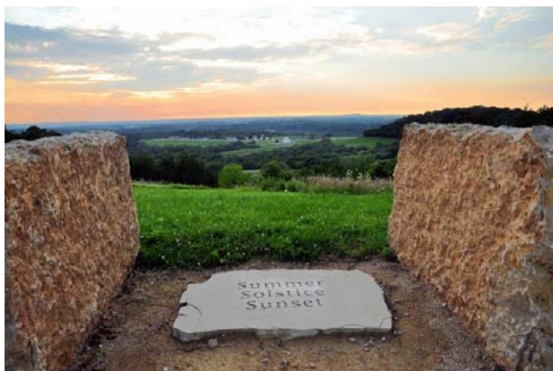
A lovely view of the eastern gateway to Galena can be had at Horseshoe Mound Preserve.

You'll experience a longer zip line adventure at Long Hollow Canopy Tours in woodlands outside the village of Elizabeth. Thrill-seekers can take a 2.5-hour journey across six zip lines -- the longest 1,230 feet -- reaching heights of 75 feet and speeds of 40 mph. Your tour begins with a 15-foot ascent to the first platform, crosses a 140-foot Sky Bridge and ends with a 40-foot rappel to the ground.