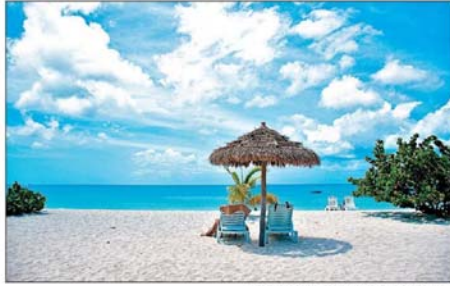
GRENADA TOURISM AUTHORITY

At Concord Falls, the three-tier waterfall cuts