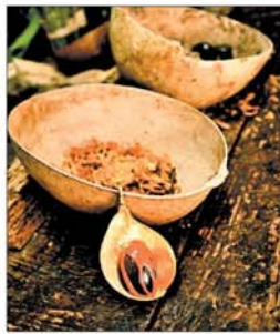
At the Dougladston Estate spice plantation, guides crack open nutmeg pods, revealing the seed.

At Dougladston Estate, guides crack open nutmeg pods to reveal a seed inside laced in red, affectionately known as the "lady in the boat with the red petticoat." The red covering becomes processed as mace. The nutmeg seed is used for flavoring, in medicine and, in some parts of the world, as a natural aphrodisiac. Inside a wooden shed, benches hold an array of other bits of plant material — leaves,