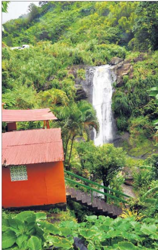
The first of three tiers of Concord Falls plunges over black volcanic rock dressed in rainforest greenery. Young men sometimes offer to jump from the top in exchange for tips.

Outside, the hot sun shines down on cocoa beans filling shallow wooden platforms where women walk slowly back and