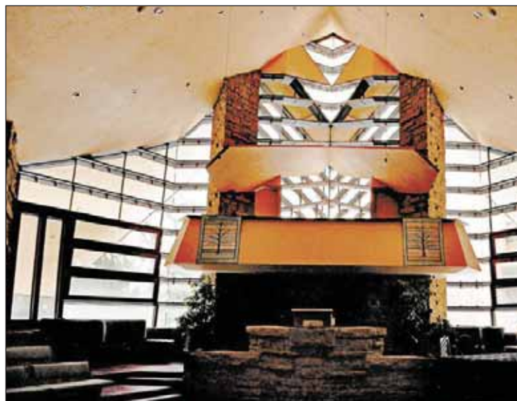
The Unitarian Meeting House in Madison was designed by Frank Lloyd Wright and is open for tours. Other Wright works are near the capital.

bar has free samples, along with chutneys, salsas, sauces and preserves. The gift shop stocks wacky mustard-themed items, as well as 300 to 400 mustards.