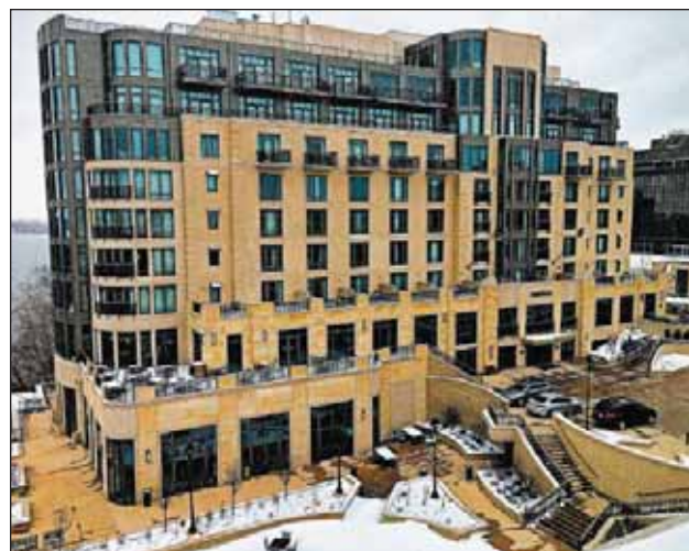
The 2014 tower of the Edgewater hotel adjoins a lakefront plaza and second hotel tower dating from the 1940s.