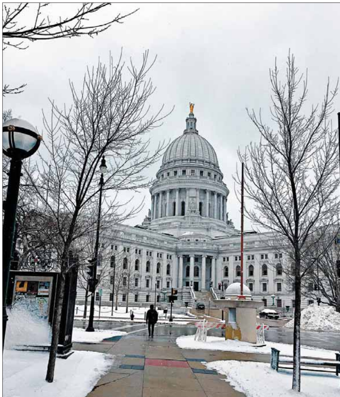
Wisconsin's Capitol building was completed in 1917 and dominates the skyline in downtown Madison.

Downstairs, the free museum displays rack after rack of mustards, along with antique mustard pots, advertisements and other memorabilia. Upstairs, a tasting