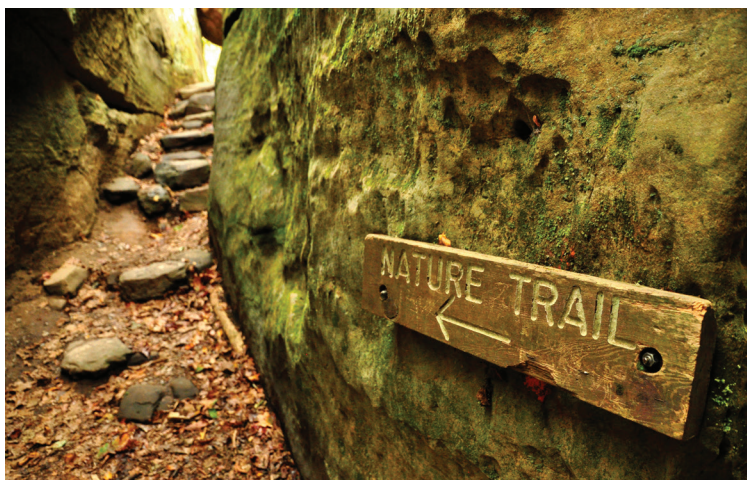
Above: Wine lovers on the Shawnee Hills Wine Trail can take a break from tastings to hike among the boulders at Giant City State Park.

Indiana's Brown County is home to several wineries within