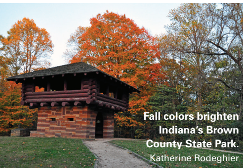
Fall colors brighten Indiana's Brown County State Park.