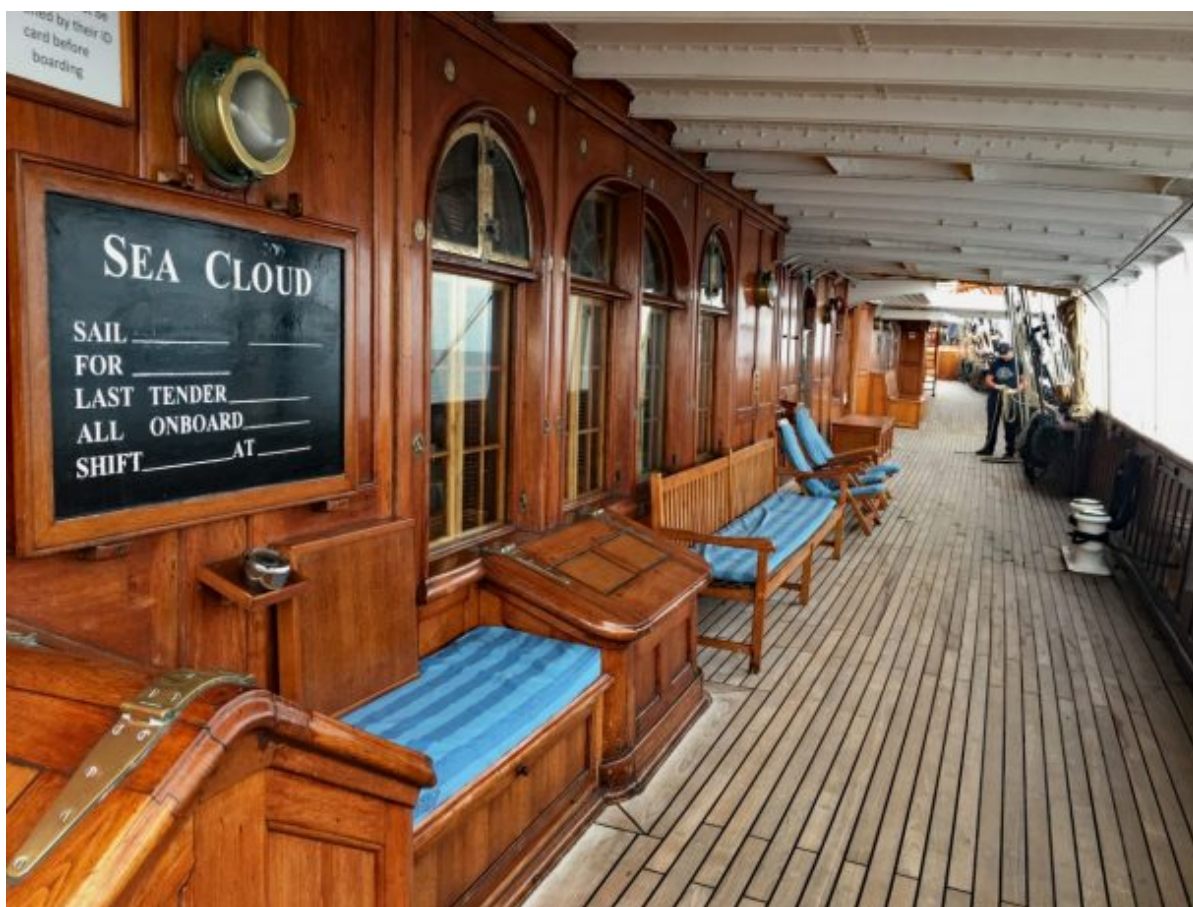
Sea Cloud's teak decks and dark wood paneling evoke the richness of a luxury vessel from the 1930s.