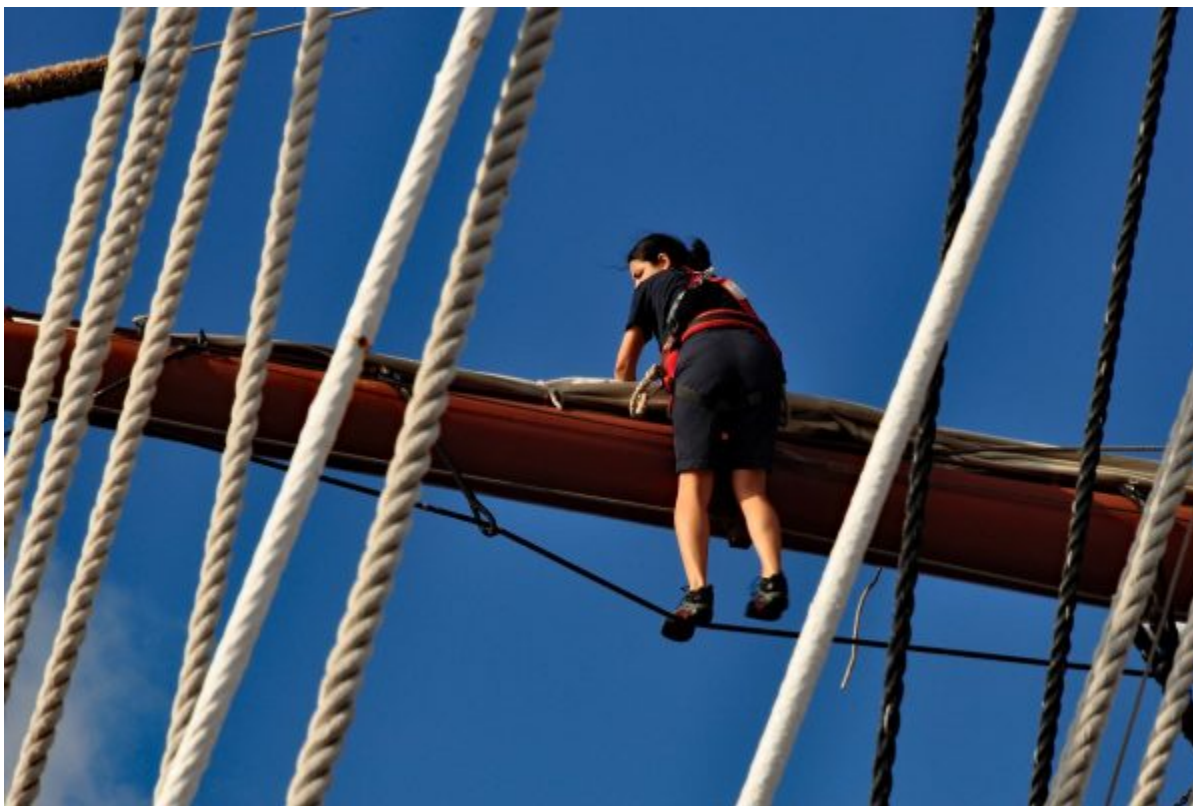
Deckhands climb Sea Cloud's masts and set her sails entirely by hand.

For many onboard, myself included, the most popular activity was simply watching the raising and lowering of sails. Sea Cloud's chief officer gave instruction to passenger volunteers who felt up to the tasks of hauling lines during the bracing of the yards and the setting and dousing of sails as well as coiling lines.