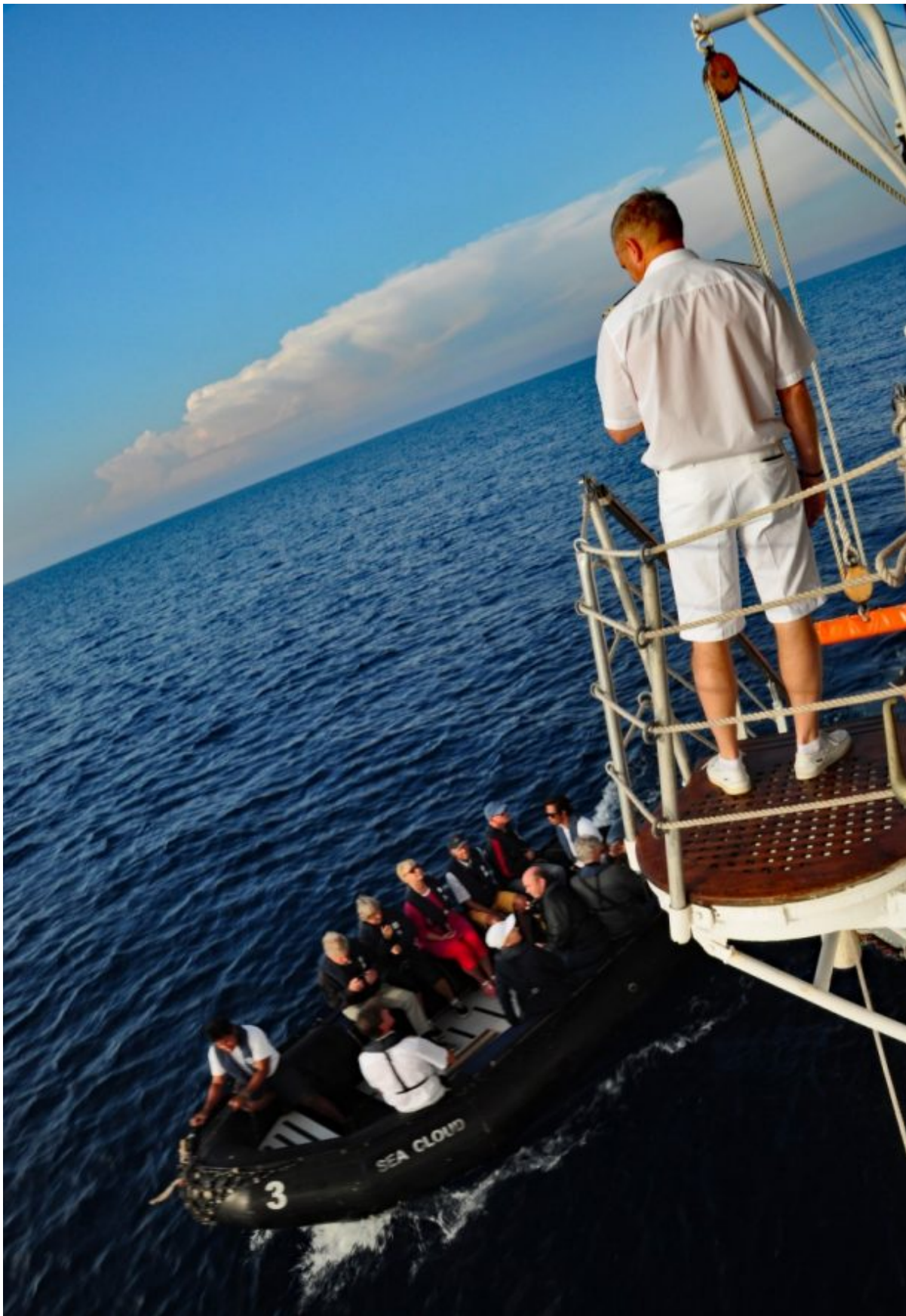
Sea Cloud zodiacs take passengers on a photo safari around the ship.