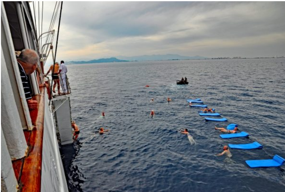
Sea Cloud passengers had a chance to swim in the Mediterranean on a cruise off the coast of Spain.

One day Sea Cloud dropped anchor and the crew lowered one of her Zodiacs to pull a string of floating platforms from the gangway for passengers to use while swimming.