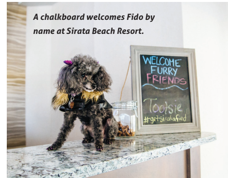
A chalkboard welcomes Fido by name at Sirata Beach Resort.

Visitors to St. Pete Beach cannot miss the massive Moorish-style "pink palace" that rests regally on the south end of the beach. Dating from 1928, The Don CeSar has functioned as