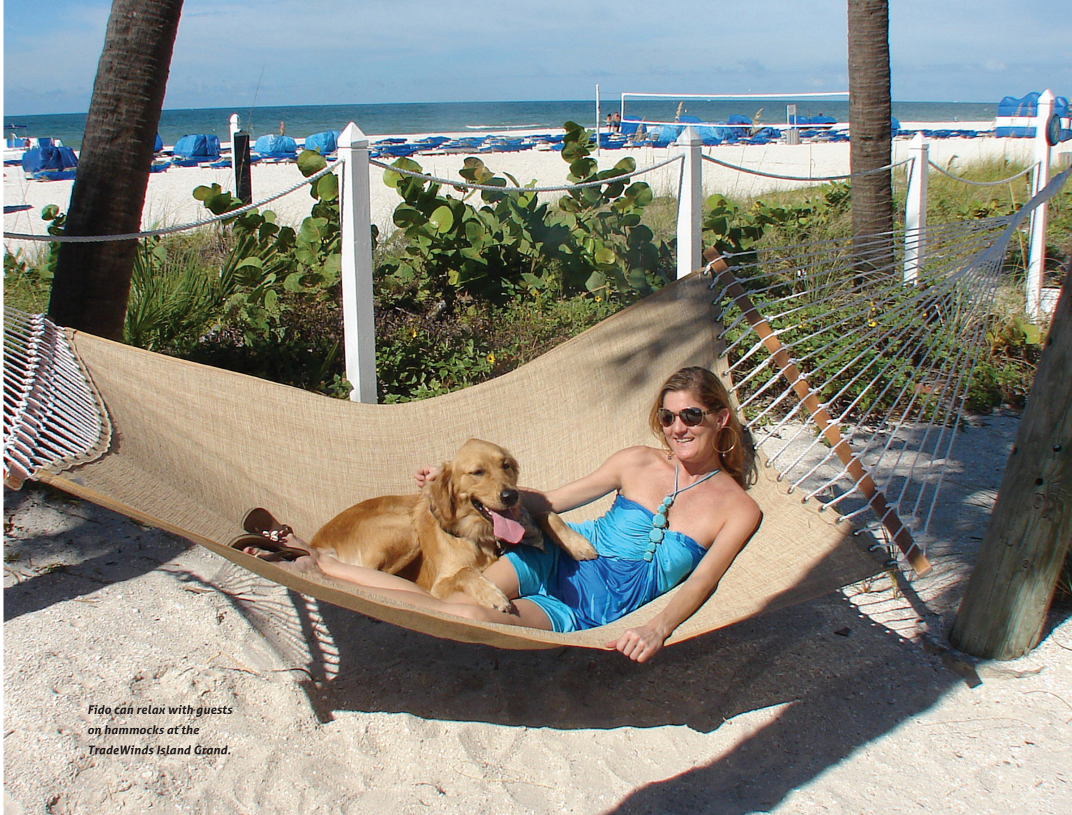
Fido can relax with guests on hammocks at the TradeWinds Island Grand.