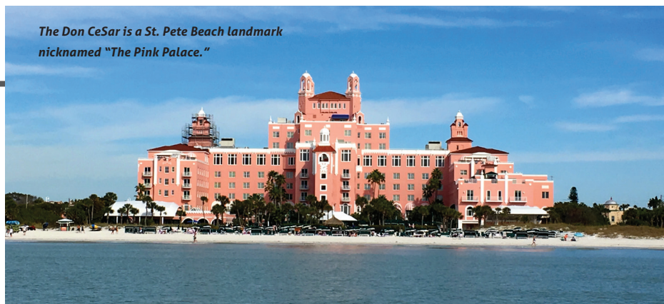
The Don Cesar is a St. Pete Beach landmark nicknamed "The Pink Palace."

A pair of beachfront resorts; (800) 360-4016; tradewindsresort.com . TradeWinds Island Grand, 48 Fido-friendly rooms of 585 rooms, from $239 in June; 5500 Gulf Boulevard, St. Pete Beach, FL 33706; (727) 367-6461. RumFish Beach Resort 10 Fido-friendly rooms of 211 rooms, from $188