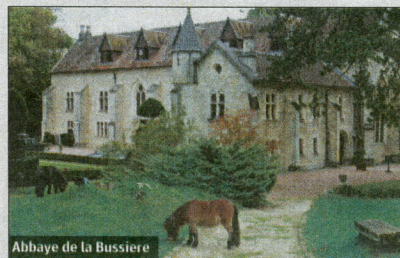
Abbaye de la Bussiere